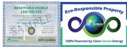
Renewable Energy Certificates (RECs)