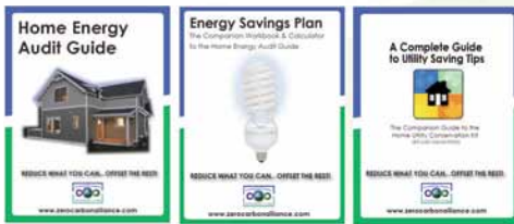
ZCA Home Energy Audit Guides