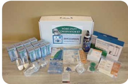
ZCA Residents Utility Conservation Kits